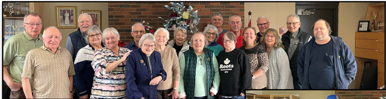
Contract Bridge was hosted by the Grande Prairie Golden Age Centre.